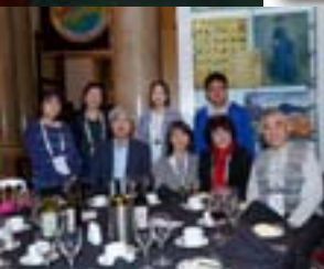
Art Museum Dinner