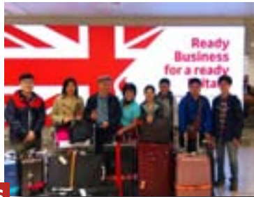
Heading for EADMFR at Cardiff

Besides the academic presentation, we aim to encourage people from Europe to participate in the 21st International Congress of IADMFR in Kaohsiung, Chinese Taipei on April 26-29 next year (see pictures at booth). We met many international friends (Poland, Romania, and Korea) at the Gala dinner in the great Cardiff Museum.