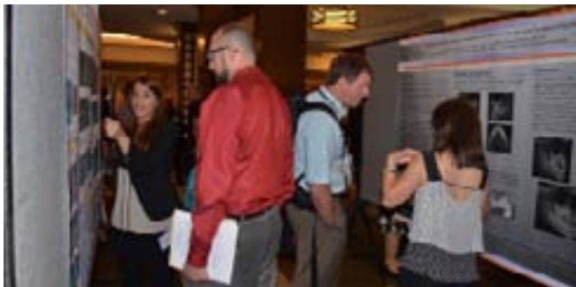
2016 AAOMR Annual Meeting Poster Session