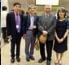
Speakers Night at Taipei