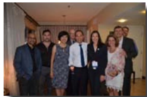
2016 AAOMR Annual Meeting Reception