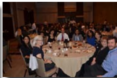
2016 AAOMR Annual Meeting Banquet