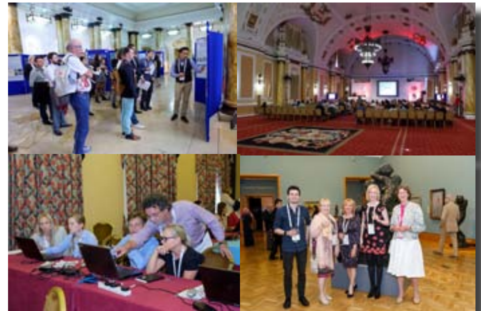
Delegates enjoying the poster session in the Marble Hall

Chair of Local Organising Committee for ECDMFR Cardiff 2016