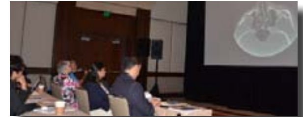
2016 AAOMR Annual Meeting Case Sharing Session