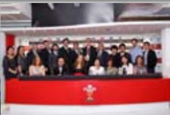
Millennium Stadium at Cardiff