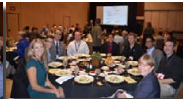
2016 AAOMR Annual Business Meeting