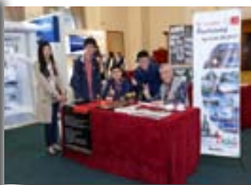
Promoting Booth at EADMFR