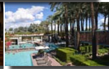
Picture 1. 2016 AAOMR Annual Session Delegate's Welcome Reception, Picture 2 . 2016 AAOMR Annual Session Conference Hall, Picture 3. 2016 AAOMR Annual Session Held in Scottsdale, Arizona, USA