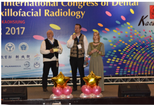
Fig 1. Hungary