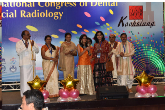
Fig 2. India