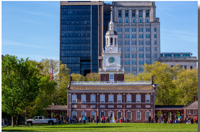
Fig.4: Independence Hall