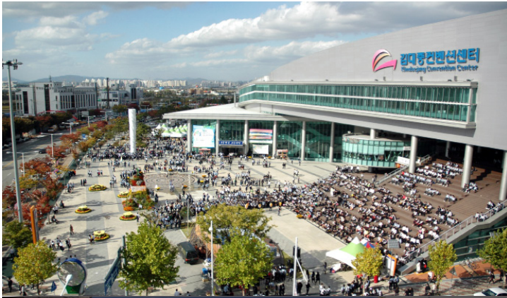
Fig. 1. Venue of the 23rd ICDMFR, Kimdaejung Convention Center is the premier exhibition and convention facility in the Honam region,