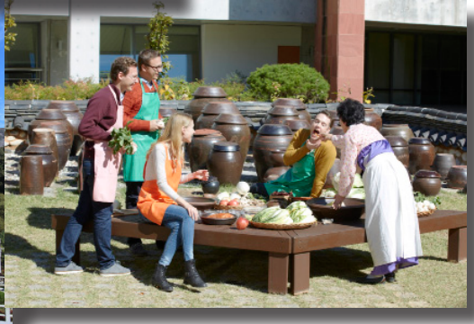
Fig. 3. Gwangju Kimchi Town is the venue for diverse kimchi-related programs like cooking experiences, art galleries, kimchi market, and other entertaining events.