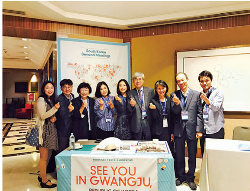
Fig 1. On the Korean promotion booth for the 2021 ICDMFR bid at the 21st ICDMFR Kaohsiung

Korean Academy of Oral and Maxillofacial Radiology