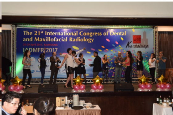
Fig 4. Turkey