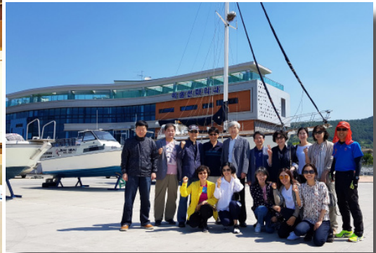
Fig 2. At the spring meeting of the Korean Council for the Faculty of Oral and Maxillofacial Radiology in Yeosu.