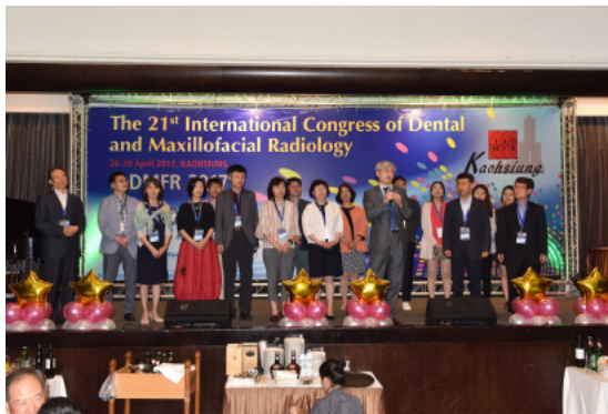
Fig 3. Korea