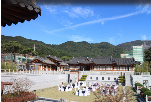
Fig. 2. Gwangju Traditional Culture Center, located at the foot of Mt. Mudeung, is built in the style of a traditional Korean house, showing the harmony between the natural and the urban, and the traditional and modern.