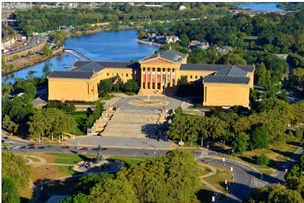
Fig.5: Philadelphia Museum of Art