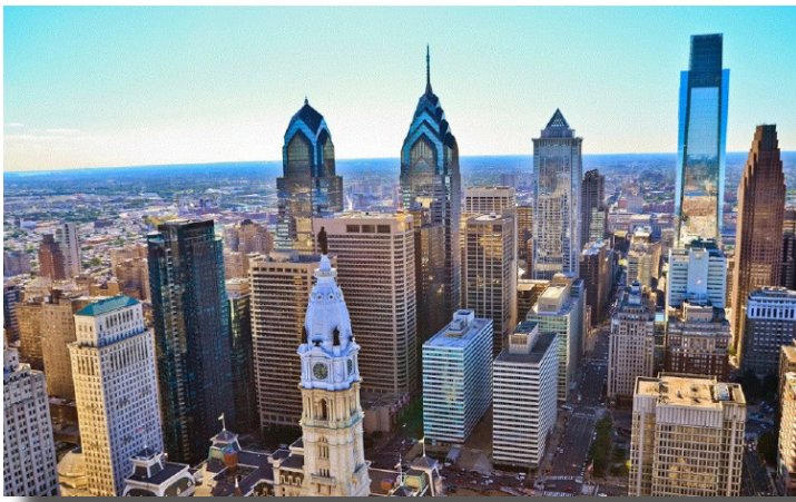
Fig.3: Philadelphia Skyline