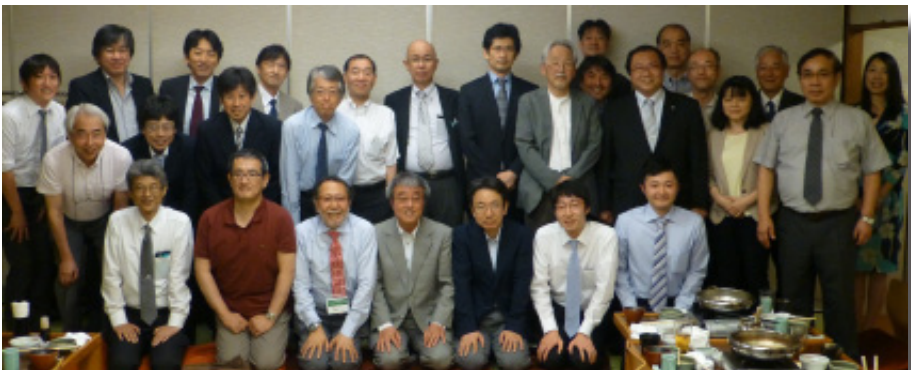
The board members of JSOMR at the 58th general assembly on 2nd June 2017.